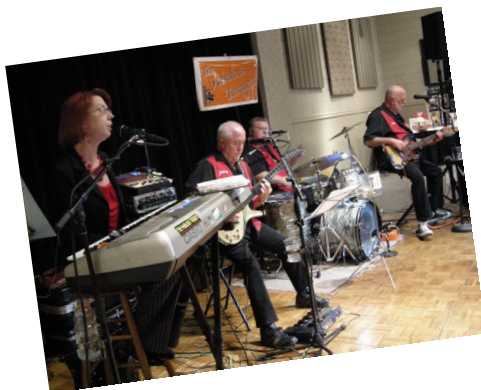
The Fabulous Torque’s